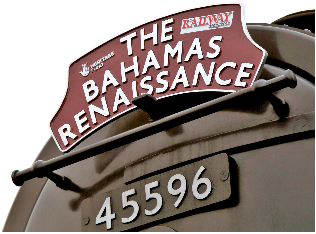
A new sign on the steam locomotive

The National Lottery-funded project also included the launch of a new Learning Coach based at Ingrow in West Yorkshire. The coach, built in 1924, was derelict for many years. It has been restored to offer classroom facilities as well as showing some compartments in their original condition.