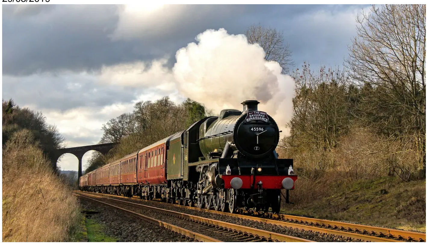
The Bahamas 45596, first built in 1934, has been commissioned back into service after a £1million restoration made possible thanks to National Lottery players.

Often referred to as the Yorkshire Jubilee, the Bahamas 45596 has recently benefited from a five-year volunteer-led restoration programme. Until February 2019, it had not hauled a train on the mainline for 25 years.