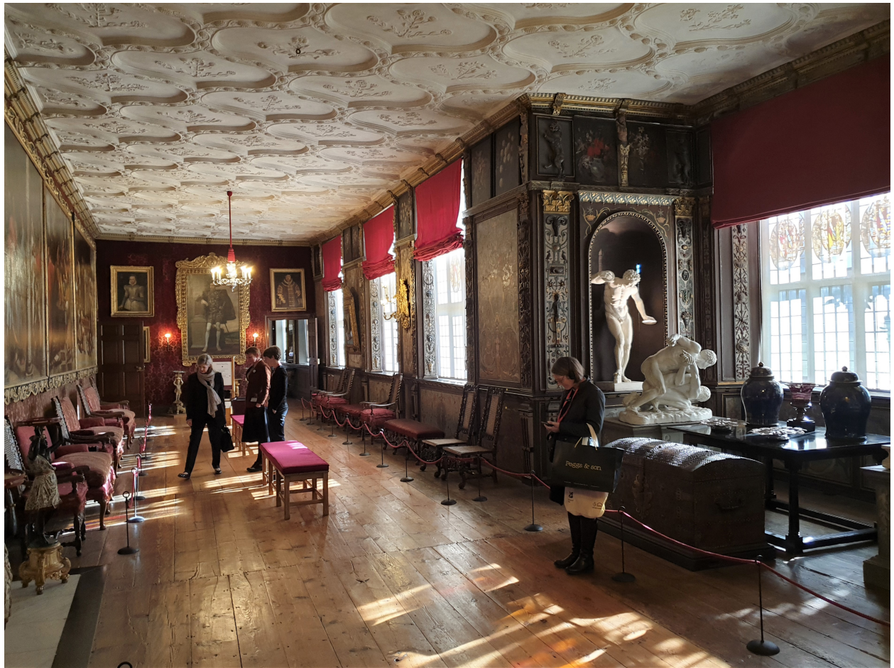
One of the grand rooms at Knole