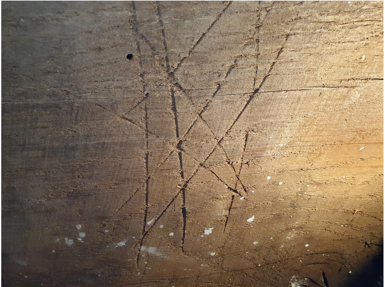
Witchmarks found at Knole