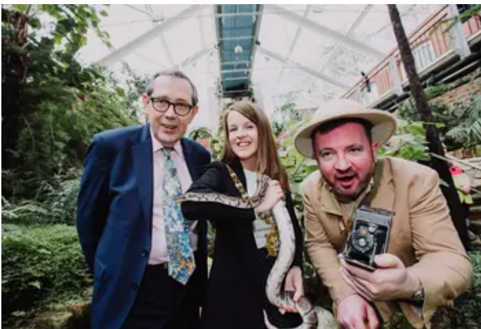
Belfast City Cemetery