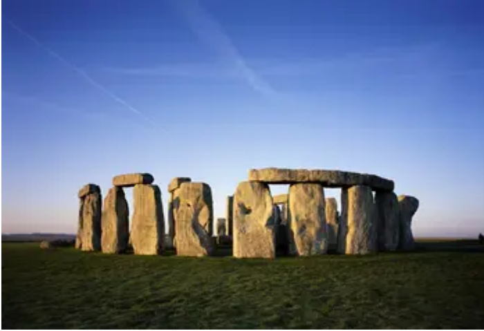
View from the east of Stonehenge at sunrise

As well as Human Henge, the National Lottery has invested £10million into transforming the site for visitors. 2018 marks 100 years since Cecil Chubb, a local barrister who had bought the ancient monument at an auction, gave it into public ownership.