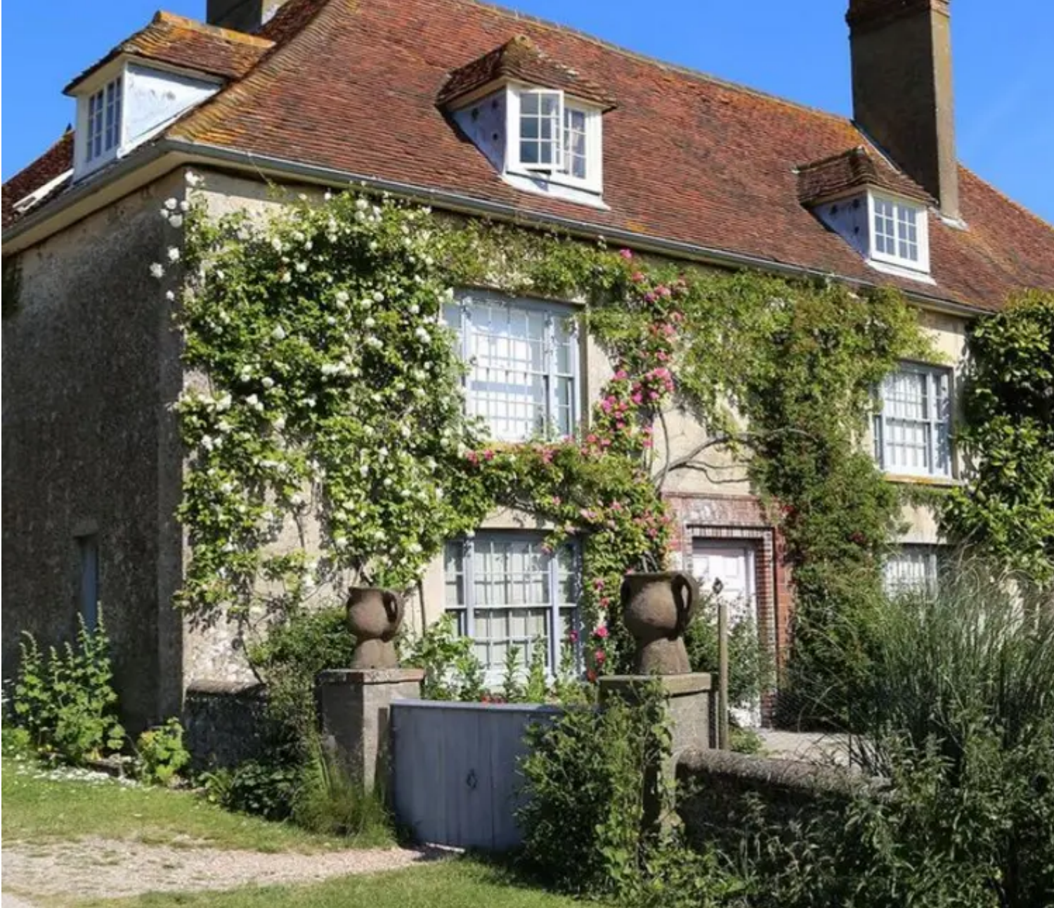
The exterior of the Charleston House

Stuck for things to do this October? Here are seven super places to visit this month - including freebies for National Lottery players.