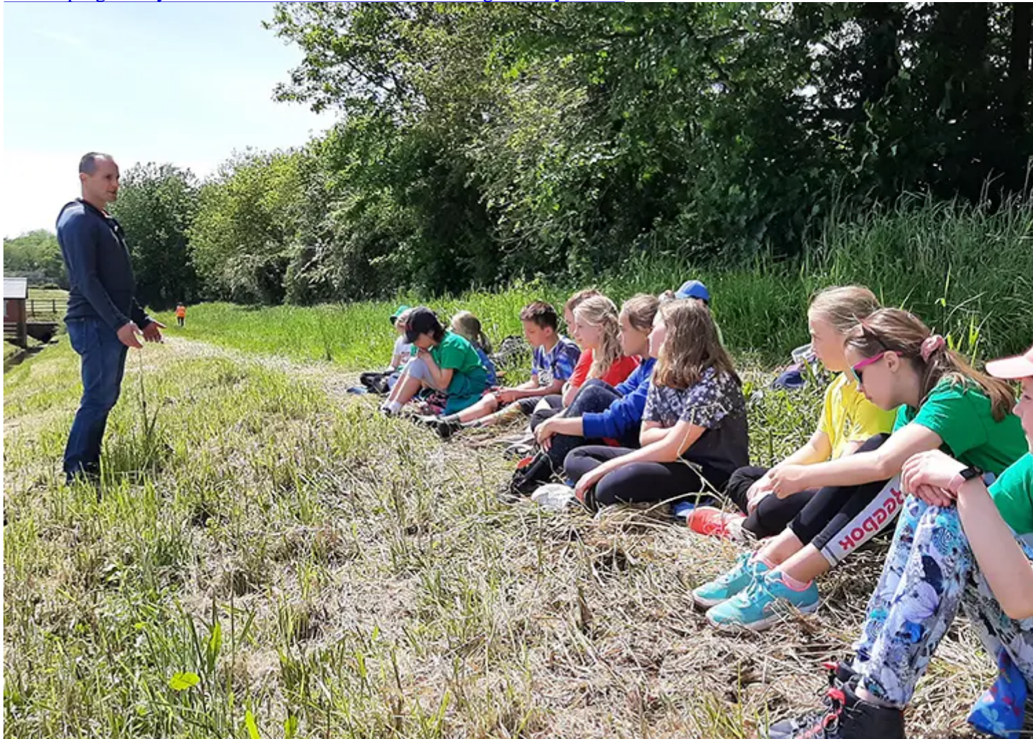
School pupils get a taste of nature in Cardiff's ancient forests