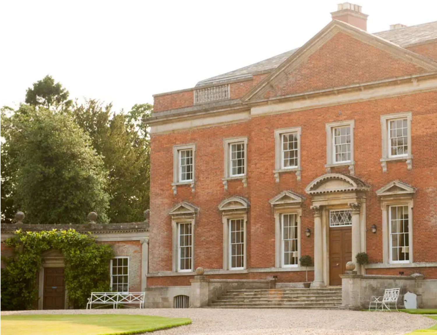
A sunny Kelmarsh Hall

Three major heritage attractions are holding free offers for National Lottery players this week.