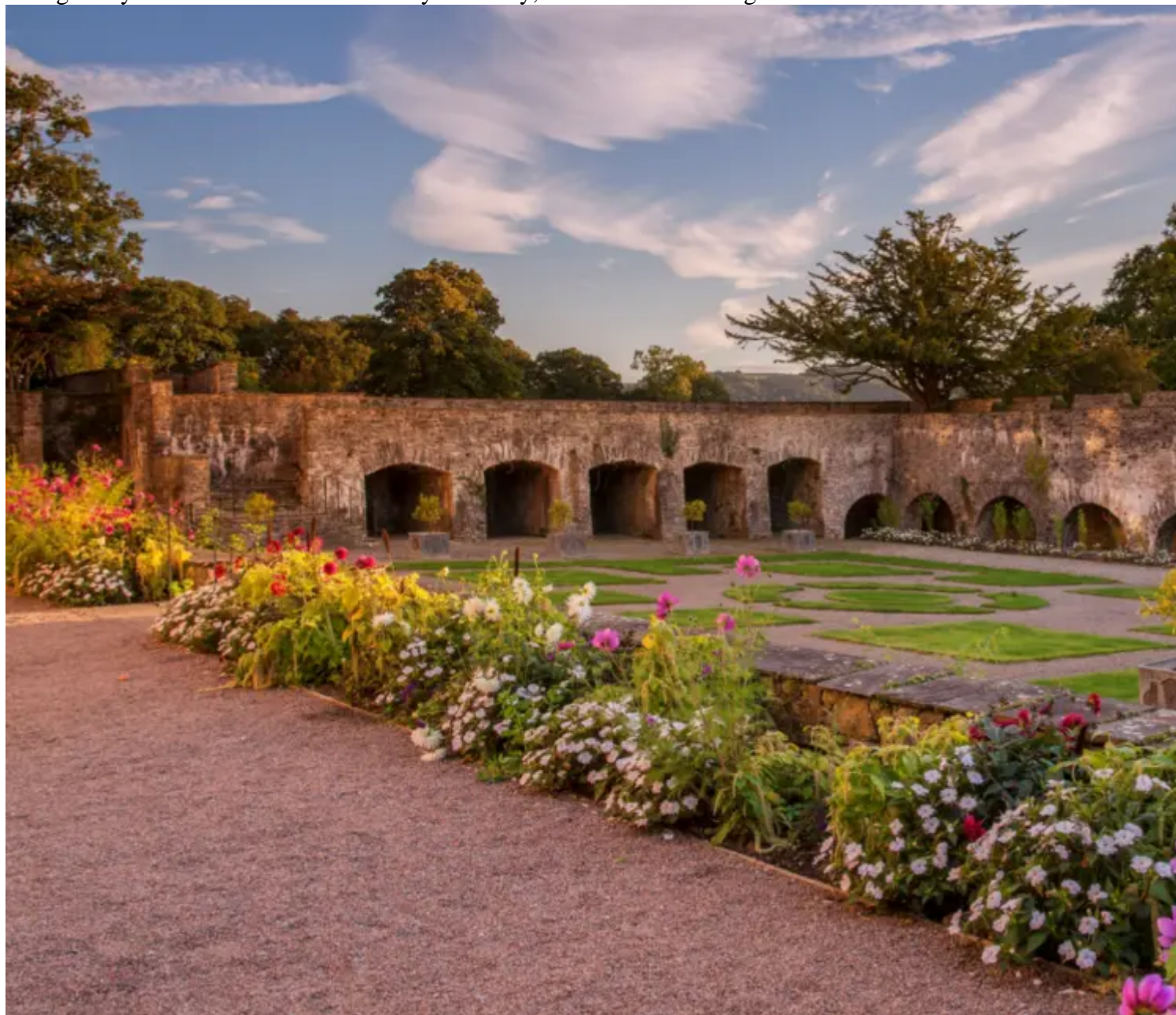
The Cloister Garden at Aberglasney House, Carmarthenshire

Aberglasney House and Gardens in the Tywi Valley, Carmarthenshire