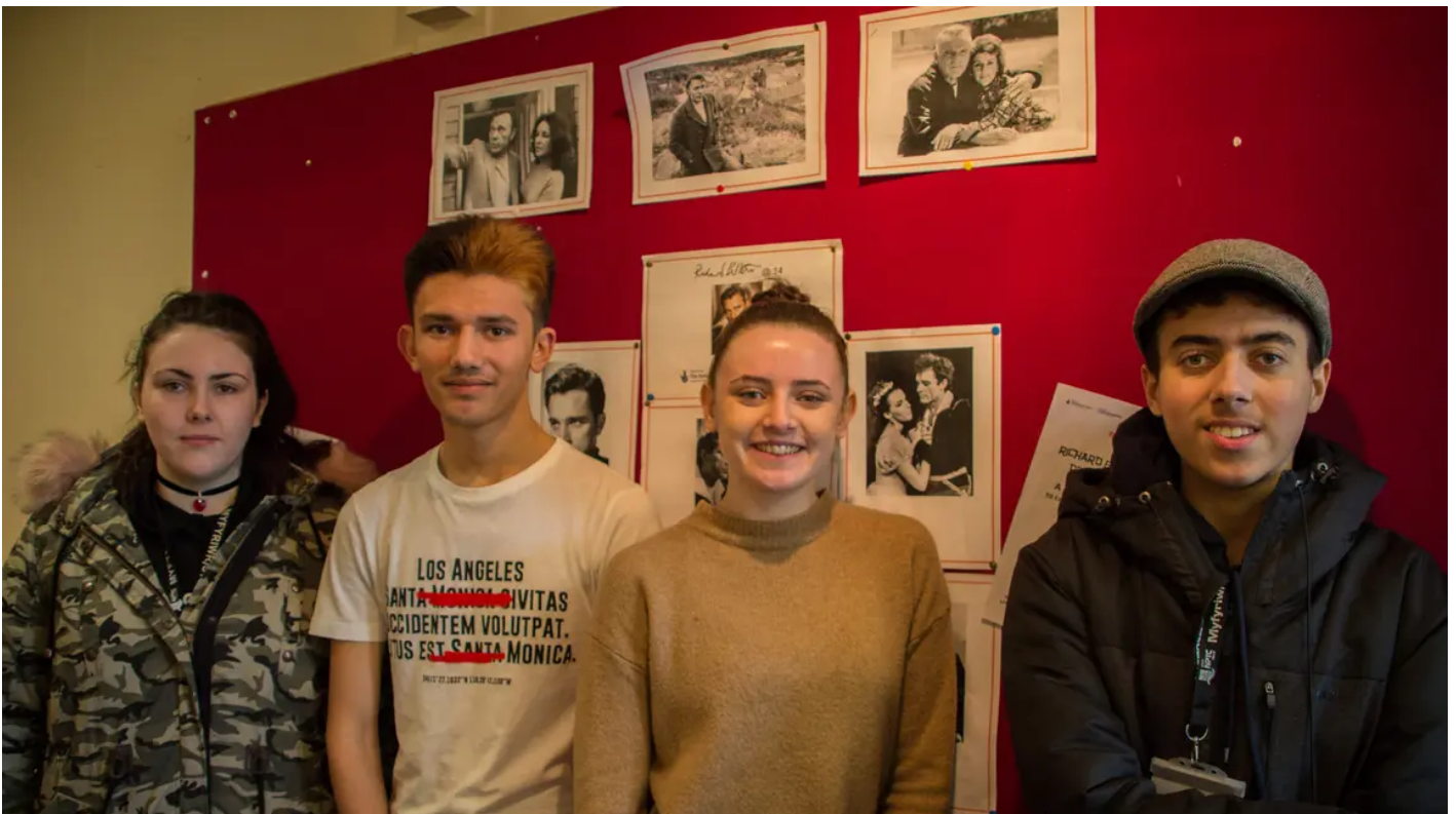
The students celebrating the results of their hard work

"Projects like this funded by the National Lottery are incredibly important as they absolutely do have the power to transform young people's lives - because they allow them to succeed and participate, as opposed to all the times they are told they can't do this or that. Suddenly they can say 'Well actually, maybe I can...'"