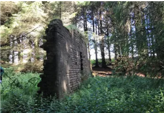
A remaining wall of the Lost Mining Village