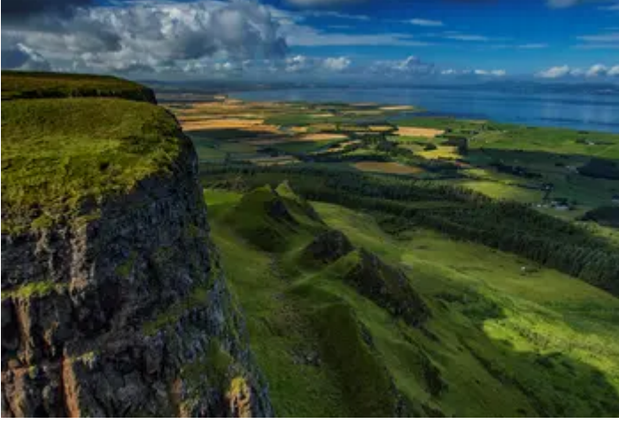
Binevenagh and the Coastal Lowlands in Northern Ireland Causeway Coast & Glens Heritage Trust