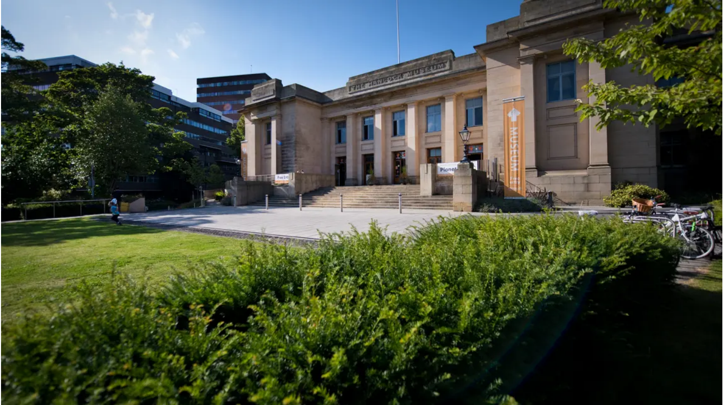
The Great North Museum: Hancock Tyne & Wear Archives & Museums

A £813,100 grant has been awarded by HLF to Tyne & Wear Archives & Museums (TWAM), one of the main partners working with NewcastleGateshead Initiative to bring the dynamic story of the North of England to life in what is set to be one of next year's biggest cultural events.