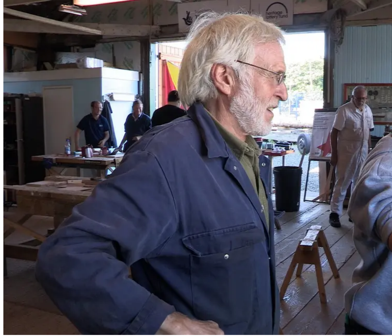
Saffron is taught the basics by a volunteer trainer