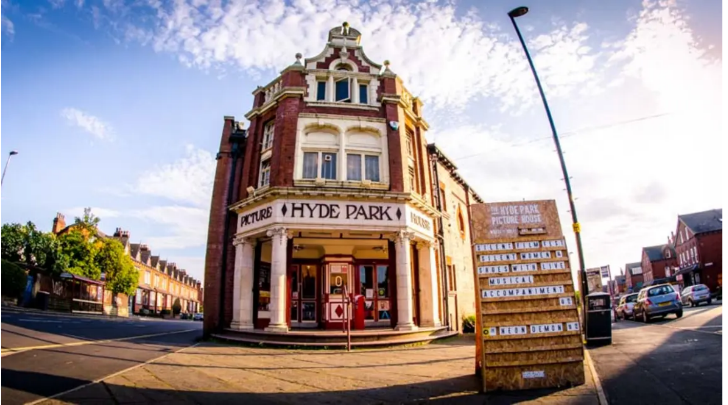
Hyde Park Picture House

William Morris' family home and a silent era cinema are among 12 projects awarded major support totalling £55million, thanks to National Lottery players.