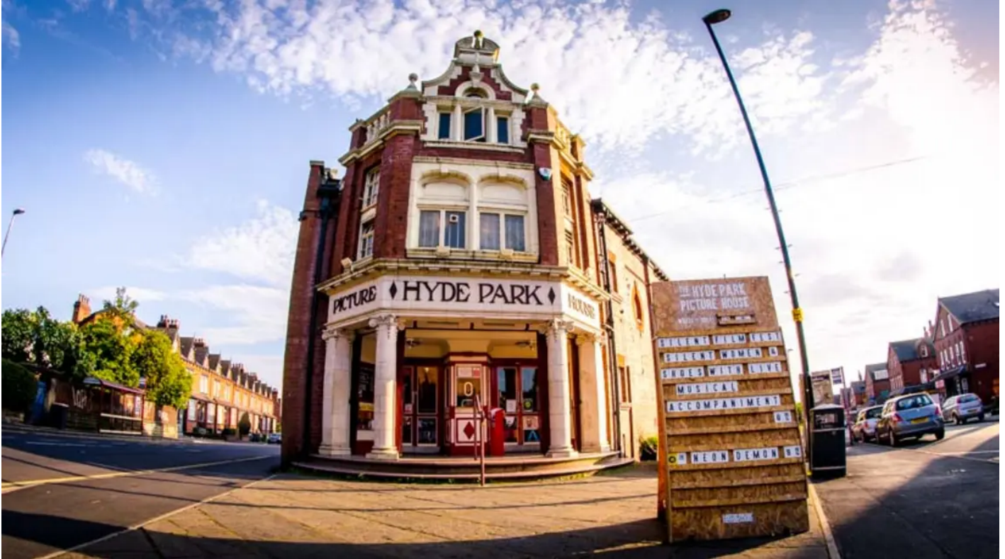
Hyde Park Picture House

William Morris' family home and a silent era cinema are among 12 projects awarded major support totalling £55million, thanks to National Lottery players.