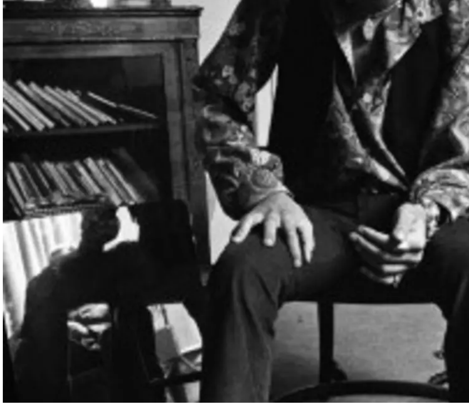
Jackpot for the nation was celebrated at the Hendrix Museum. The Handel House Trust

National Lottery players raised a staggering £179million for arts, sports, heritage and community projects in January – the highest total ever raised by National Lottery players in a single month.