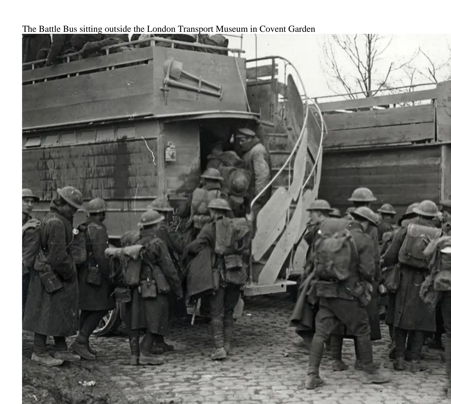
British troops making use of the Battle Bus in Arras in France, 1917