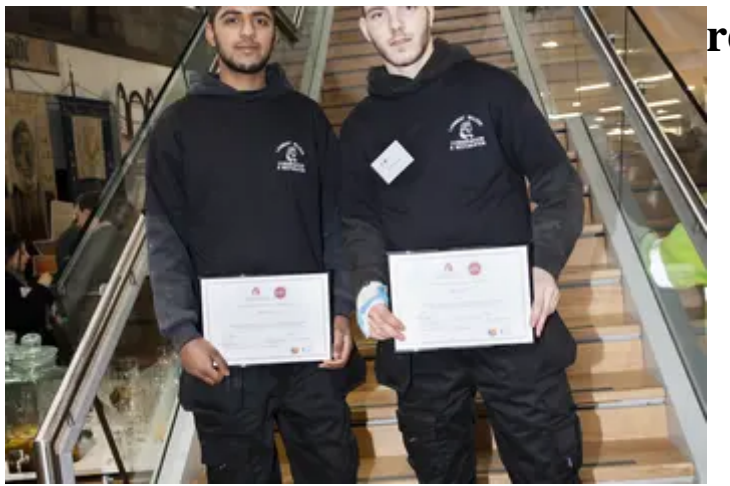
rdeb hefyd mewn ...