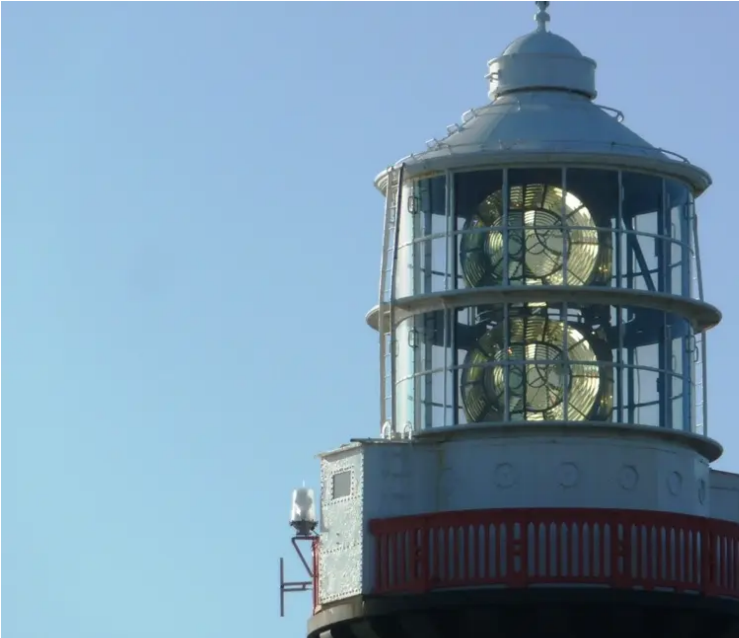
The Mew Island lighthouse

National Lottery funding has helped transform how Belfast showcases its maritime heritage.