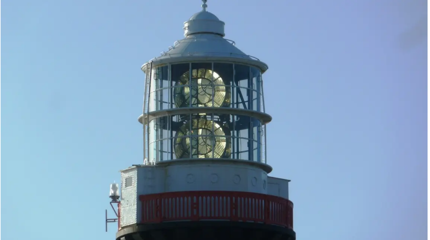
The Mew Island lighthouse

National Lottery funding has helped transform how Belfast's showcases its maritime heritage.