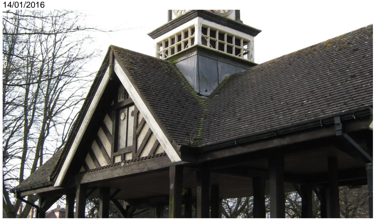
Page Park's clock tower is a symbol for Staple Hill

The grant forms a large part of the total project cost of £2,182,114 for Page Park.