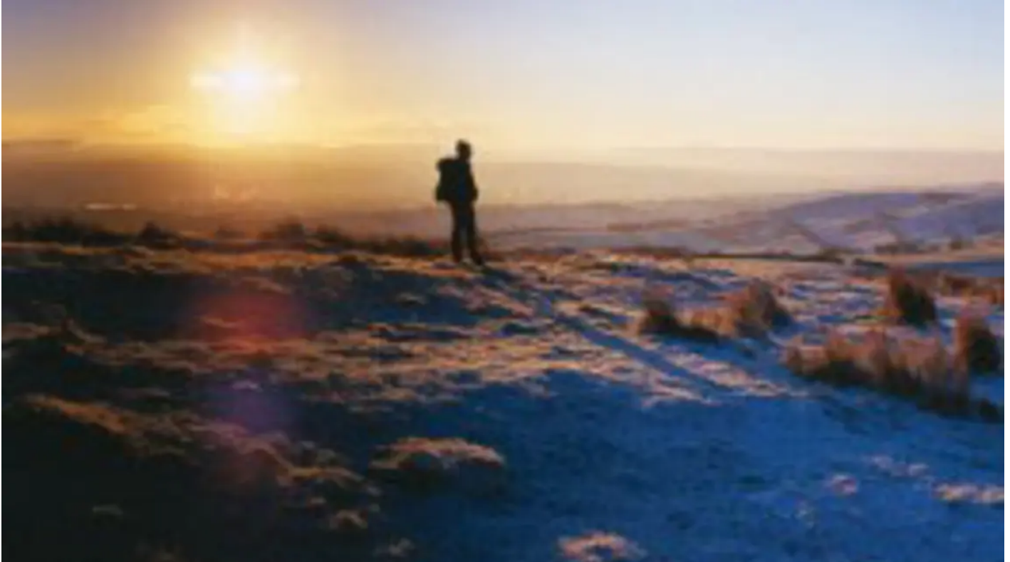
Pendle Hill at sunset

The area around Pendle Hill has long been associated with the story of 10 local people accused of witchcraft during the 17th century. However, the area has a wide and fascinating heritage and the Pendle Hill Partnership is now set to help people gather and research this wealth of history, including the founding of the Quaker movement by George Fox.