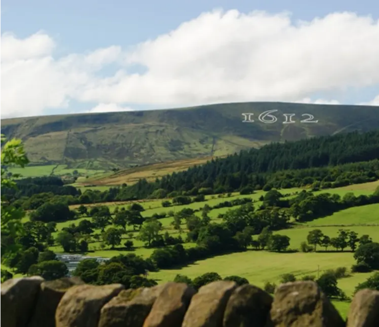
Part of Pendle Hill carved with 1612 Alastair Lee

Today, the Heritage Lottery Fund (HLF) is marking the spookiest day of the year with a £31m investment in some of the UK's most distinctive landscapes, including the home of the infamous 17th-century Pendle Witches. This major funding package - impacting 3,000km 2 of countryside - will support urgent conservation work to the natural and built heritage, help reconnect local communities to where they live and create 50 new jobs and 6,000 paid training places.