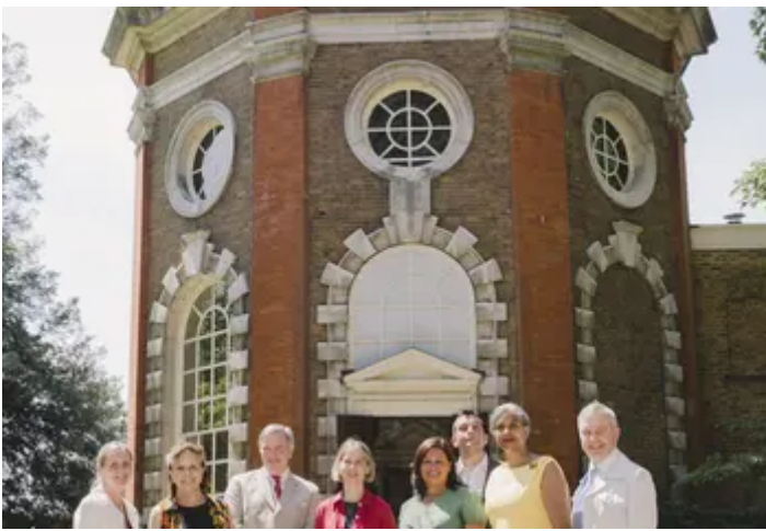
Orleans House Gallery

Orleans House Gallery set to be transformed – thanks to £1.8m funding