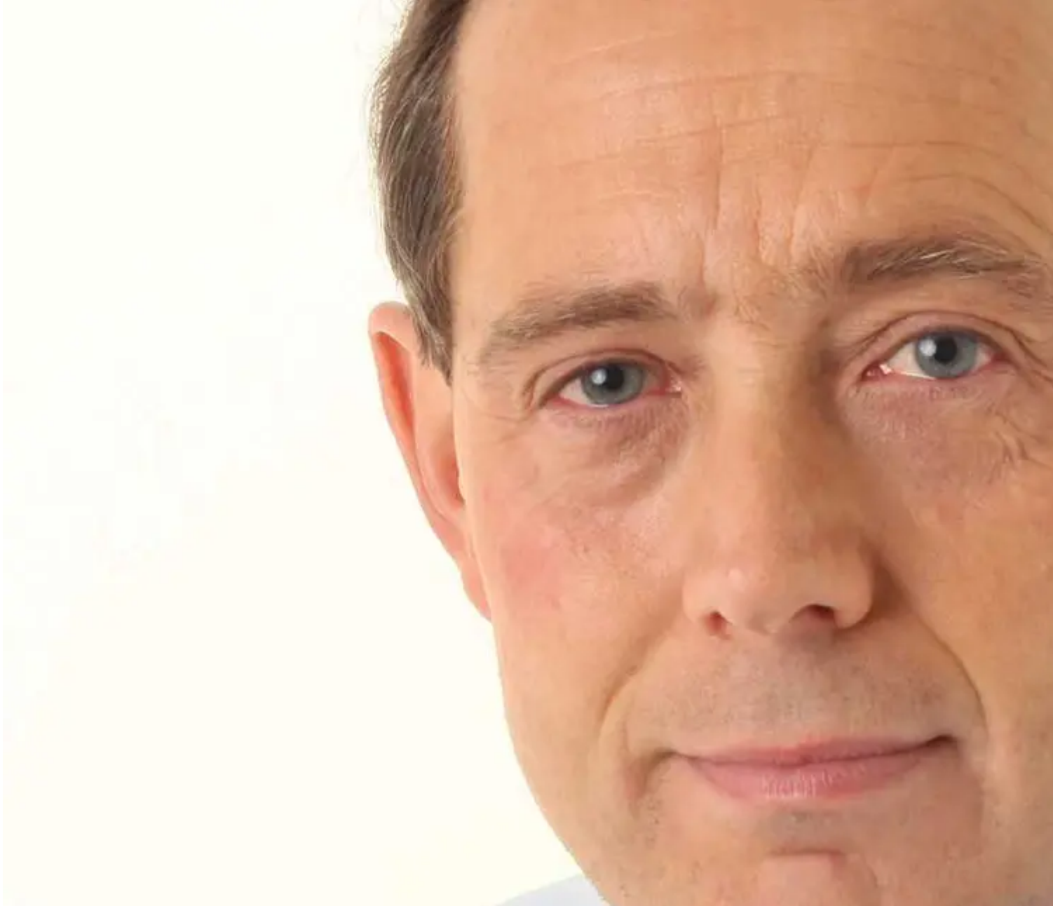
Sir Peter Luff

Our capital city is internationally renowned for its museums, galleries and landmarks but London's rich heritage can also be discovered in its landscapes, its industries and the communities which call it home.