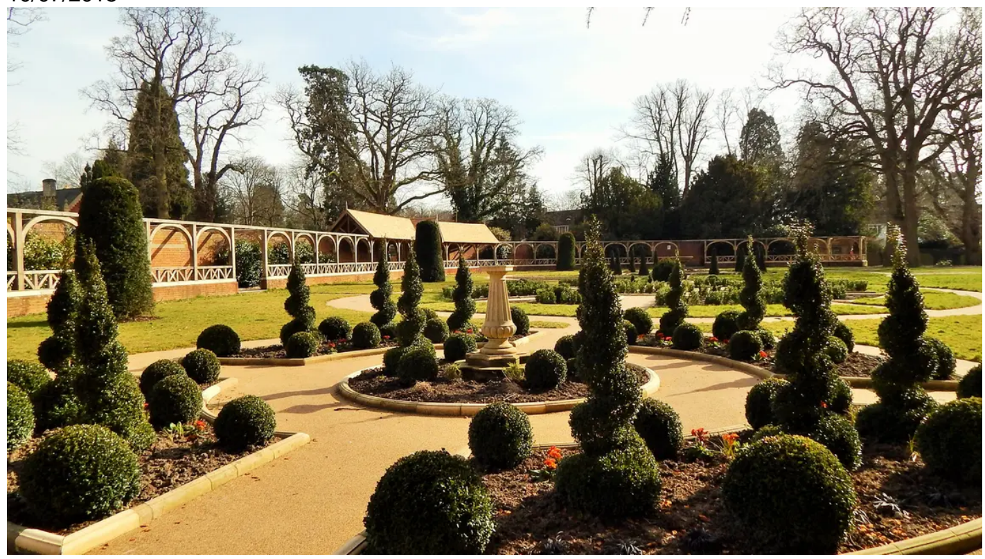
Worth Park has been restored to its former Victorian glory

Bring your family along with a picnic to this free, traditional, fun day and enjoy the great entertainment arranged throughout the day in the grounds of this beautiful and historic park. And for those with a sweet tooth, there will also be delicious cream teas available for sale.