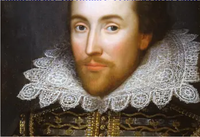
William Shakespeare, 1564 - 1616

Shakespeare Birthplace Trust secures Lottery grant to unlock the heritage of