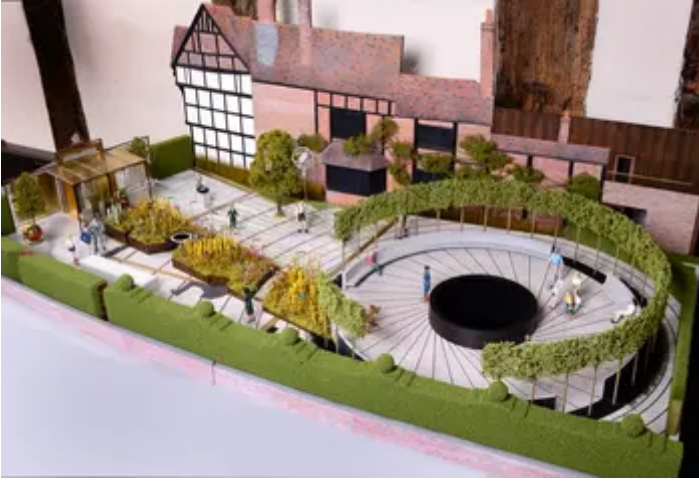
Model of Shakespeare's New Place Stewart Writtle

Shakespeare Birthplace Trust secures Lottery grant to unlock the heritage of