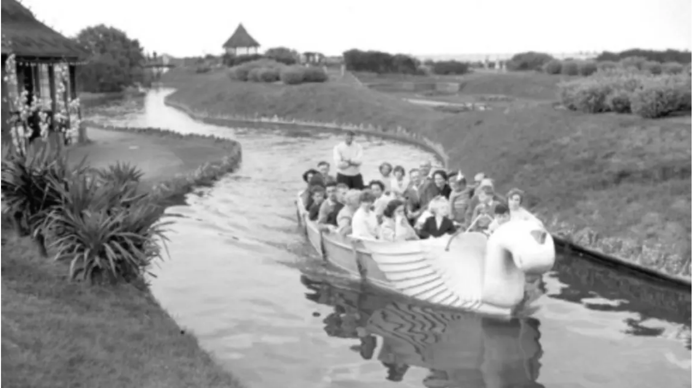
The Waterways in their heyday

When first opened in 1928, the Waterways, along North Drive, were the height of fashion, with hundreds of holidaymakers enjoying boat rides along the serpentine 'canal' and walks in the surrounding parkland, which at the time boasting a radical planting scheme.