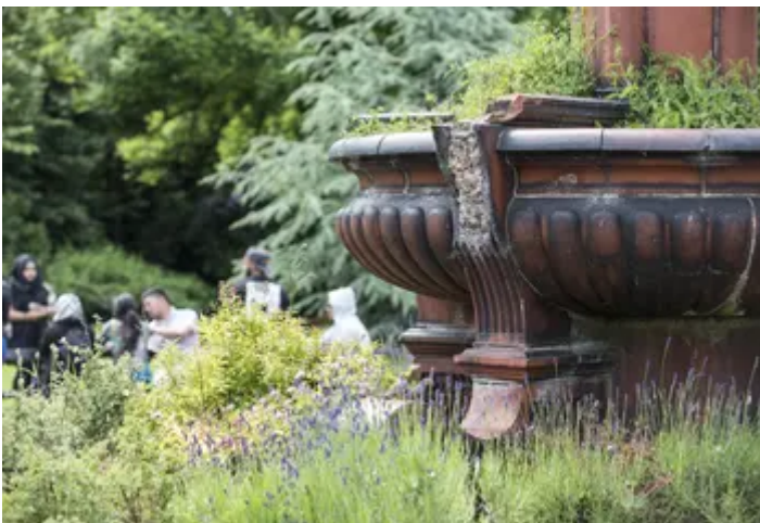
...s restoration is approved