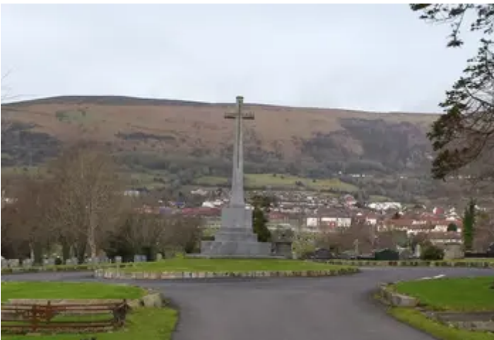
onal Lottery windfall