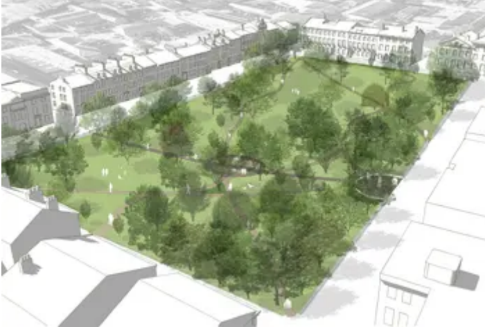
Computerised image of Winckley Square after restoration