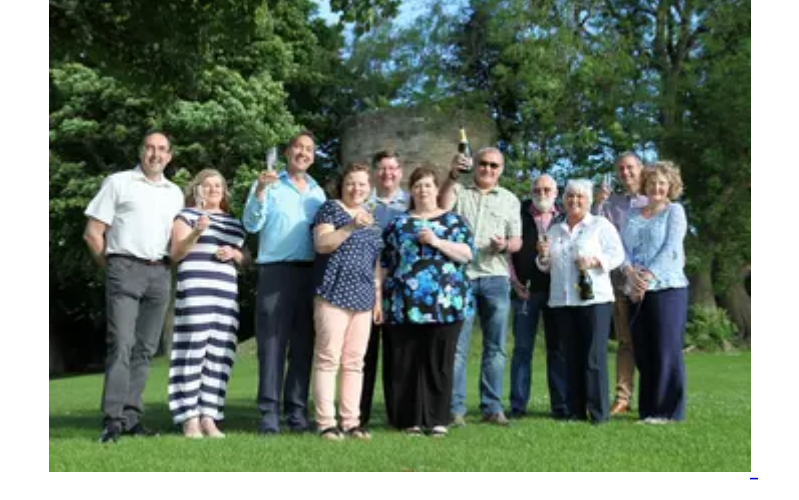
Friends of Chase Park celebrate the news of just under £1million National Lottery investment