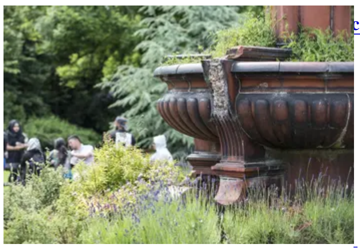
The Waterways in their heyday