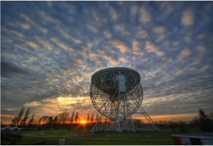
The Lovell Telescope at Jodrell Bank at sunset