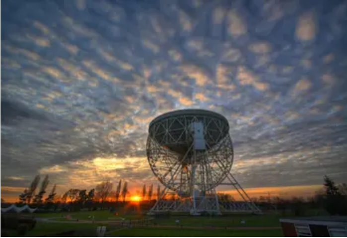
The Lovell Telescope at Jodrell Bank at sunset