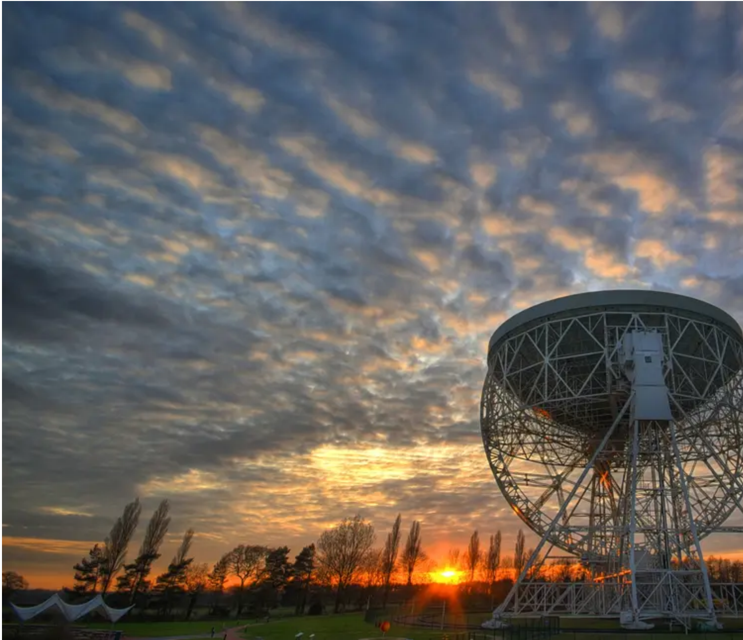
The Lovell Telescope at sunset

The project aims to conserve and restore the heritage of the Jodrell Bank site and create a spectacular new space in which visitors can engage with and learn about the journey to explore our place in the Universe.