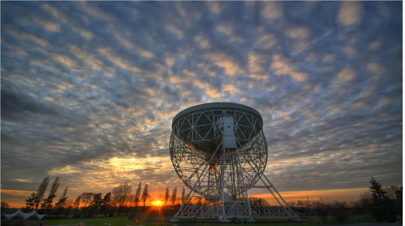
The Lovell Telescope at Jodrell Bank at sunset

Today, the Heritage Lottery Fund (HLF) has announced support worth £98m for nine major sites in England and Scotland. The stories to be told include that of the UK's ground-breaking role in science and industry from the invention of radio astronomy at Jodrell Bank to our unique railway heritage; from one of the world's earliest factories at Derby Silk Mill to the world's largest medical collection at the Science Museum. They will increase awareness and understanding of our scientific and industrial heritage, inspiring the scientists and engineers of the future.