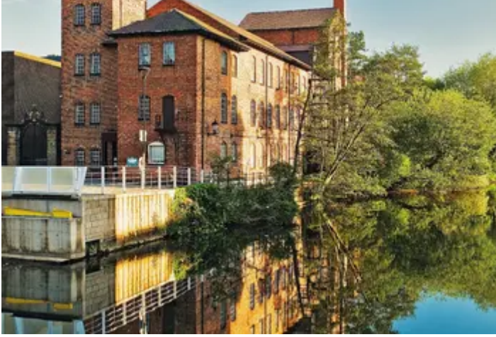
Derby Silk Mill