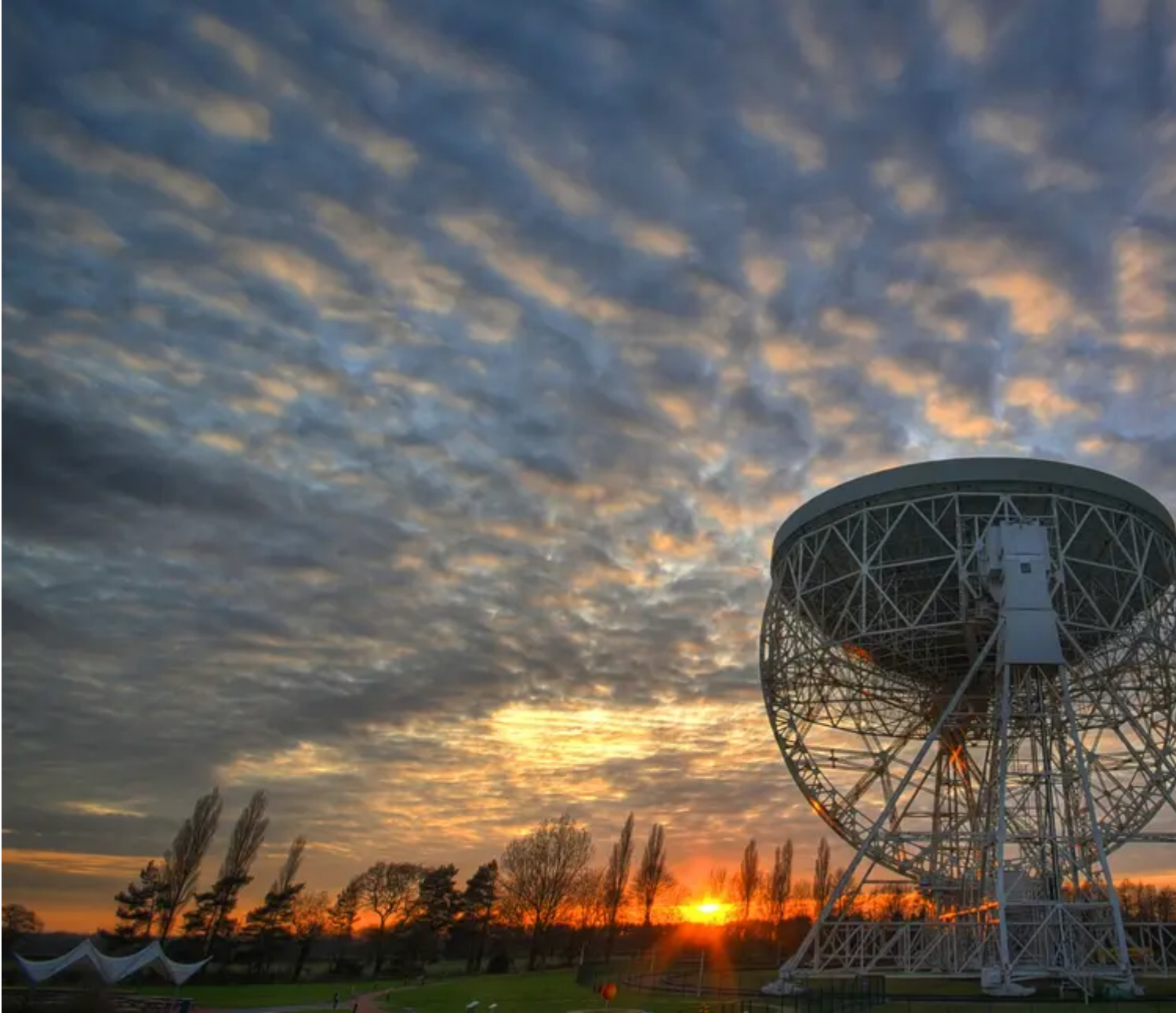
The Lovell Telescope at Jodrell Bank at sunset

Today, the Heritage Lottery Fund (HLF) has announced support worth £98m for nine major sites in England and Scotland. The stories to be told include that of the UK's ground-breaking role in science and industry from the invention of radio astronomy at Jodrell Bank to our unique railway heritage; from one of the world's earliest factories at Derby Silk Mill to the world's largest medical collection at the Science Museum. They will increase awareness and understanding of our scientific and industrial heritage, inspiring the scientists and engineers of the future.