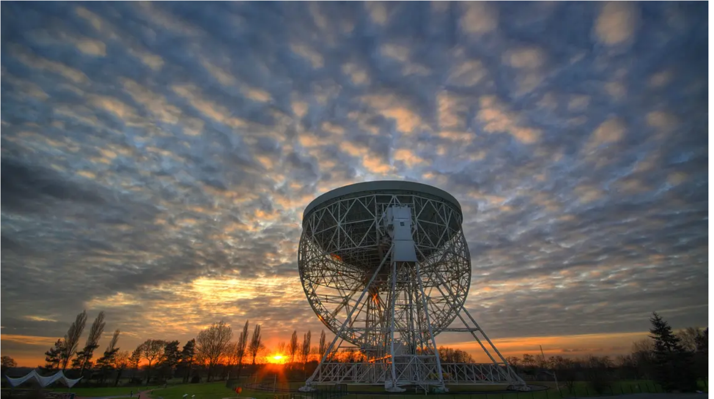
The Lovell Telescope at Jodrell Bank at sunset

Today, the Heritage Lottery Fund (HLF) has announced support worth £98m for nine major sites in England and Scotland. The stories to be told include that of the UK's ground-breaking role in science and industry from the invention of radio astronomy at Jodrell Bank to our unique railway heritage; from one of the world's earliest factories at Derby Silk Mill to the world's largest medical collection at the Science Museum. They will increase awareness and understanding of our scientific and industrial heritage, inspiring the scientists and engineers of the future.