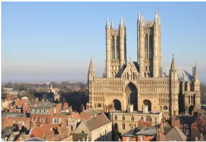
Derby Silk Mill