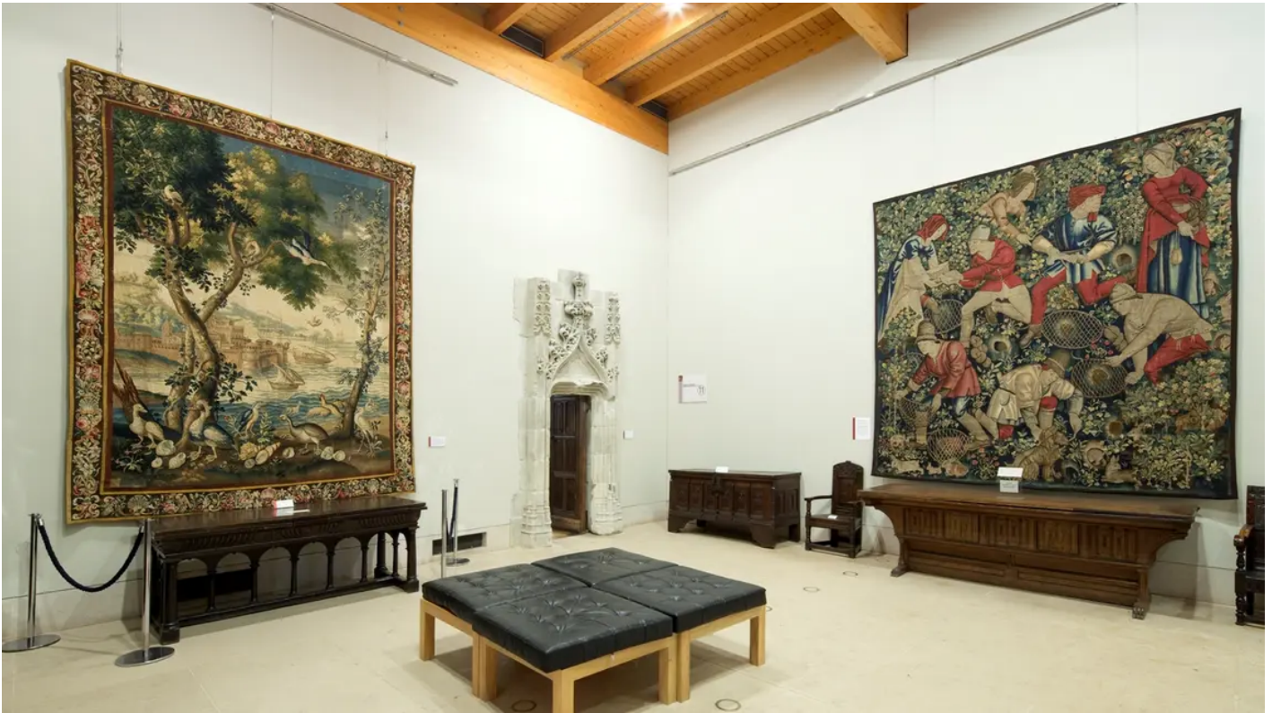
Inside one of the galleries in the Burrell Collection

Today, HLF's UK Board announced support of £15million for the transformation of the Burrell Collection including the award of a grant of £1million to assist Glasgow City Council and Glasgow Life in developing the project to the next stage of the application process.