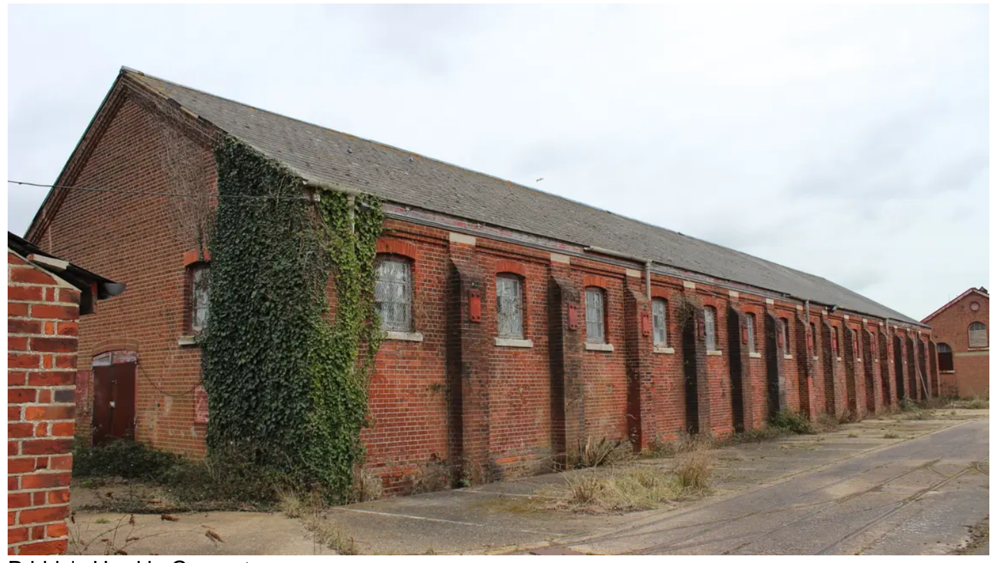
Priddy's Hard in Gosport

The grant is part of the HLF's Heritage Enterprise programme, targeting projects which create new sustainable economic uses for derelict historic buildings.