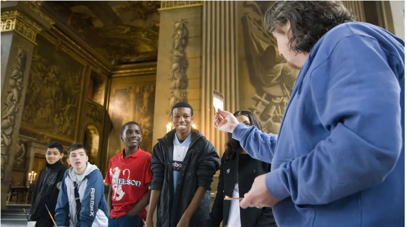
School children exploring the heritage of the Painted Hall in Greenwich

To coincide with 20 years of investment into the UK’s heritage amounting to over £6billion, the Heritage Lottery Fund (HLF) commissioned BritainThinks to conduct in-depth research in 12 towns and cities representative of the UK population. The aim was to better understand the public’s view of that National Lottery investment and to see to what extent it had made places better to live and work in or visit.