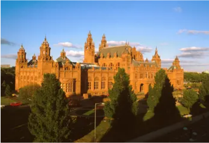
Kelvingrove Art Gallery and Museum

Research reveals Glasg ow people think their city's heritage makes it a better place to