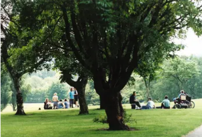
Heaton Park, one of the projects in Manchester featured in the 20 Years 12 Places research

Research reveals Glasg ow people think their city's heritage makes it a better place to