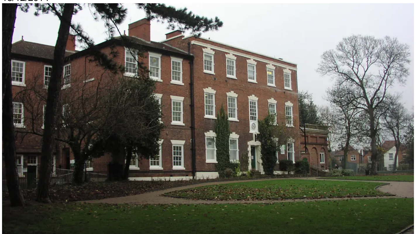
Bridgford Hall, Nottingham

Today, the Heritage Lottery Fund (HLF) is announcing grants totaling £3.3million that will make three vacant and derelict historic buildings commercially viable, putting them back to business use.