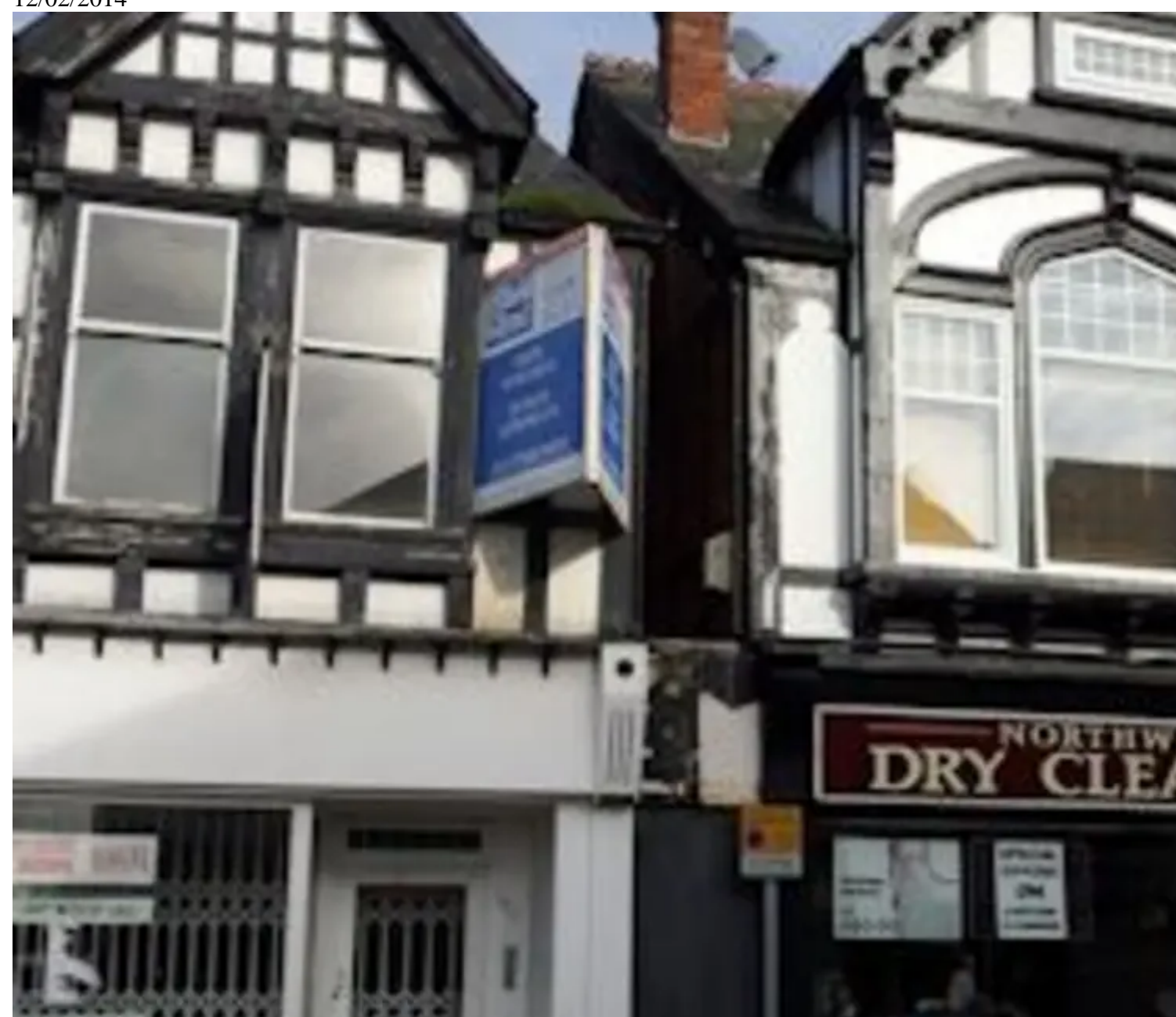
Historic buildings in Witton Street which form part of the TH scheme

The town has been earmarked for a grant under the Heritage Lottery Fund's (HLF) Townscape Heritage Initiative fund, it was announced today.