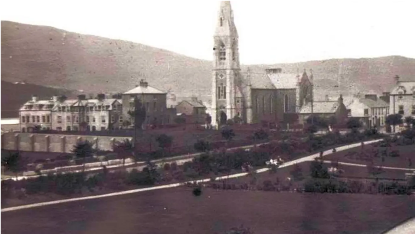
Warrenpoint Park Circa 1915

The ambitious proposals from Newry and Mourne District Council to restore the Victorian park to its former glory have received a £932,000 grant through the Heritage Lottery Fund's (HLF) Parks for People programme.