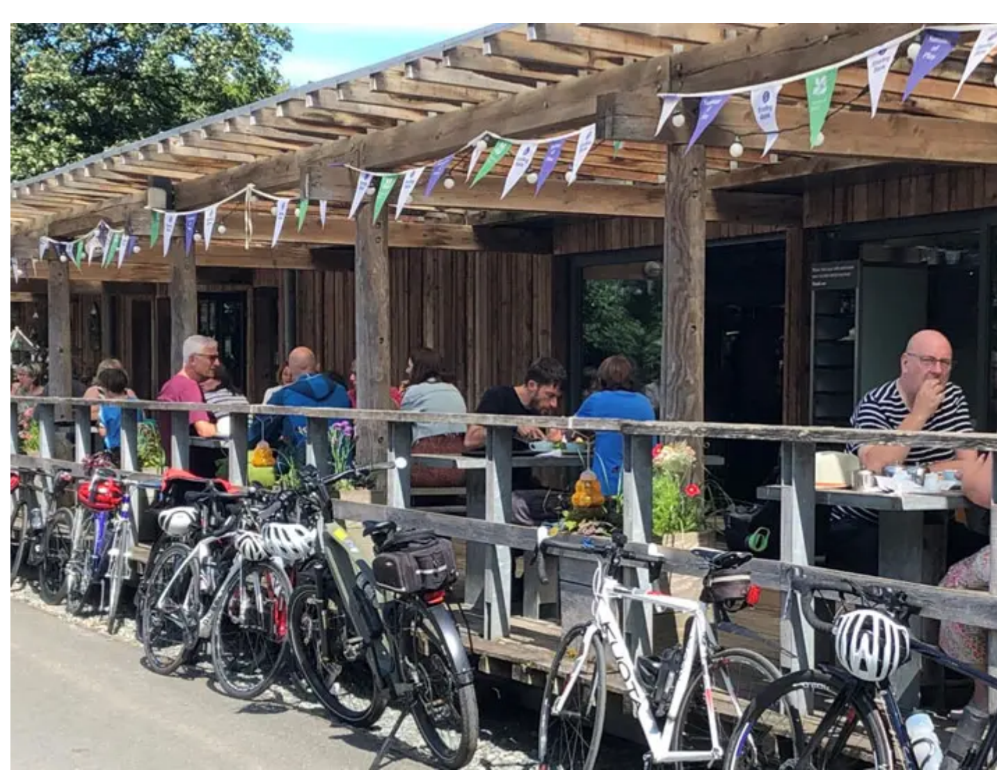
Visitors enjoy the cafe at Sizergh, Cumbria. It's popular with cyclists and bus passengers are welcomed with a free hot drink.

Like many heritage organisations, the National Trust sees most of its visitors arriving by car. In 2024, it ran a pilot project with Good Journey to explore how best to encourage greener travel and enable visitors to reach 34 of its properties car-free. It put on a summer bus to Wallington, finding that eight out of 10 passengers said they "couldn't travel any other way", an electric bike hire from Arnside station to Sizergh and a free