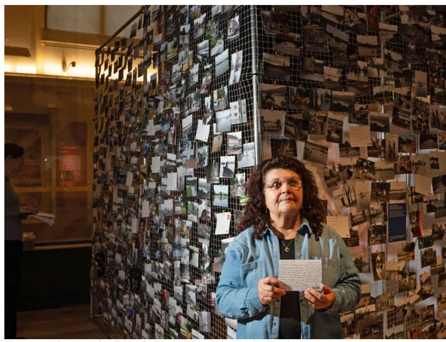
The community memories display in Waters Rising.

Waters Rising frames the global climate emergency through a local lens, examining the impact of flooding on communities in Perthshire, past and present, while also tracing its effects on other cultures and landscapes. Produced using sustainable principles, it features a co-created display of photos and memories from local people impacted by flooding and traces the history of climate activism in Scotland.