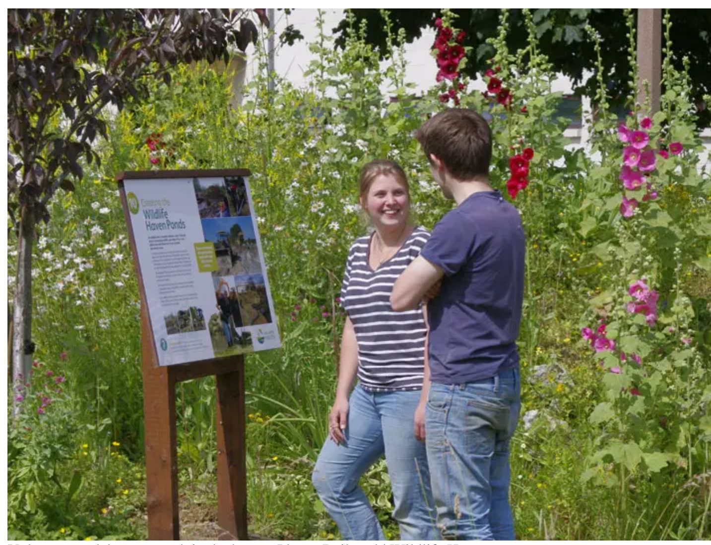
Volunteers celebrate growth in the haven.

The Railworld Wildlife Haven is a visitor attraction in Peterborough created by volunteers. Once a derelict coal yard, the land was purchased and donated by founder Rev Richard Paten and is now a much-loved community green space and a wildlife corridor along the River Nene. Reclaimed railway infrastructure has been repurposed and the land has been shaped into streams, ponds and habitats to increase biodiversity in this inner-city site where visitors can connect with nature.