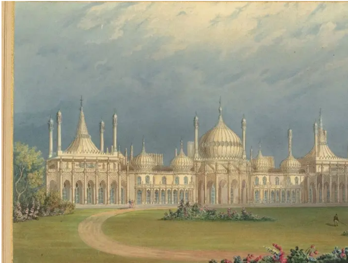
A painting of the Brighton Pavilion in the 19th century.

Twelve archives – whose records date as far back as 1792 – have received cataloguing grants. Their projects will shine a light on subjects ranging from female Paralympians to public transport, and mental health treatment to community youth theatre.