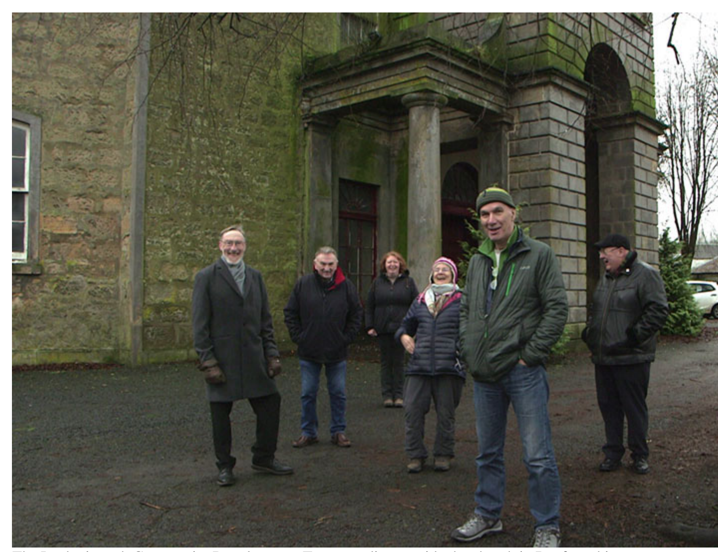
The Lochwinnoch Community Development Trust standing outside the church in Renfrewshire.