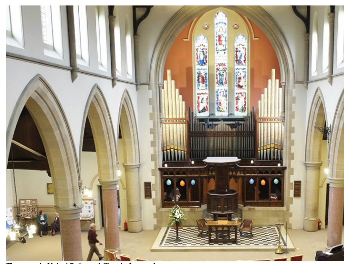
The organ in United Reformed Church, Jesmond.

Our £163,600 grant will help bring the two places of worship closer together and find more links between them, through the Discover Jesmond 1888 project. As well as conserving the organs, it will create a heritage trail and events programme to engage the community with the churches' shared heritage.