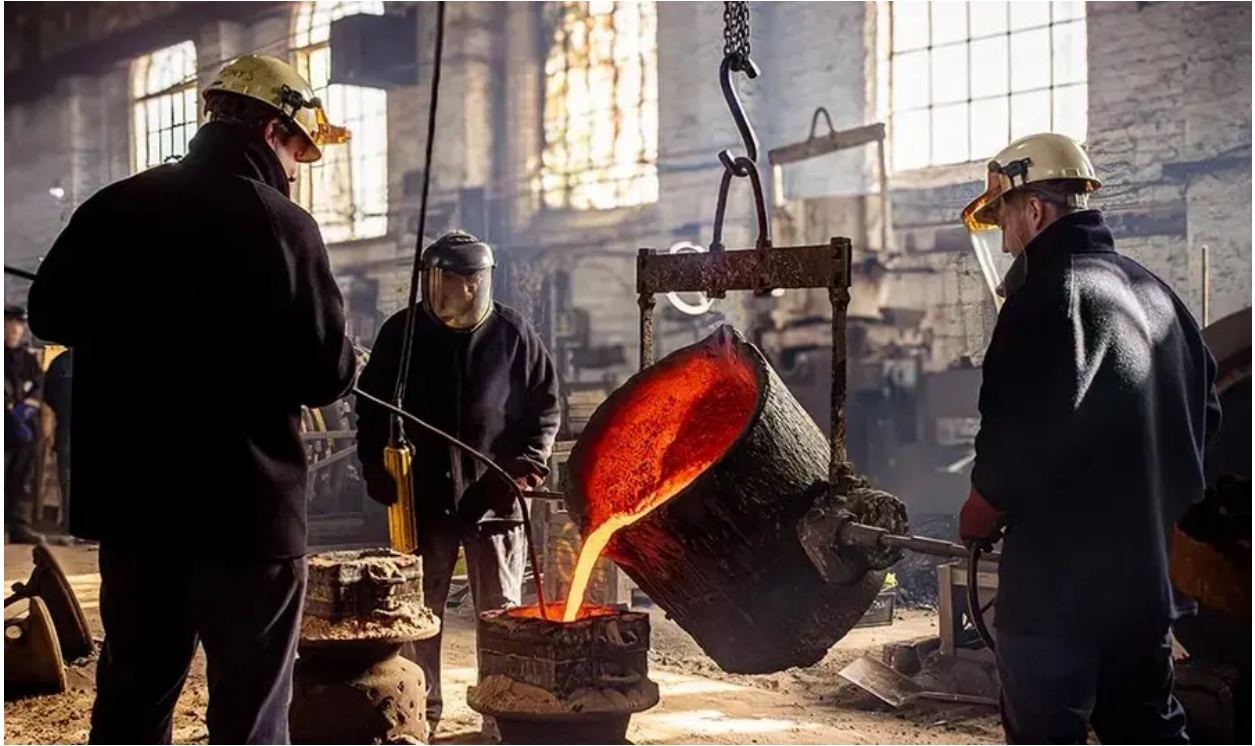
Casting a bell at Taylor's Bellfoundry.

community hub with spaces for wellbeing, retail and events.