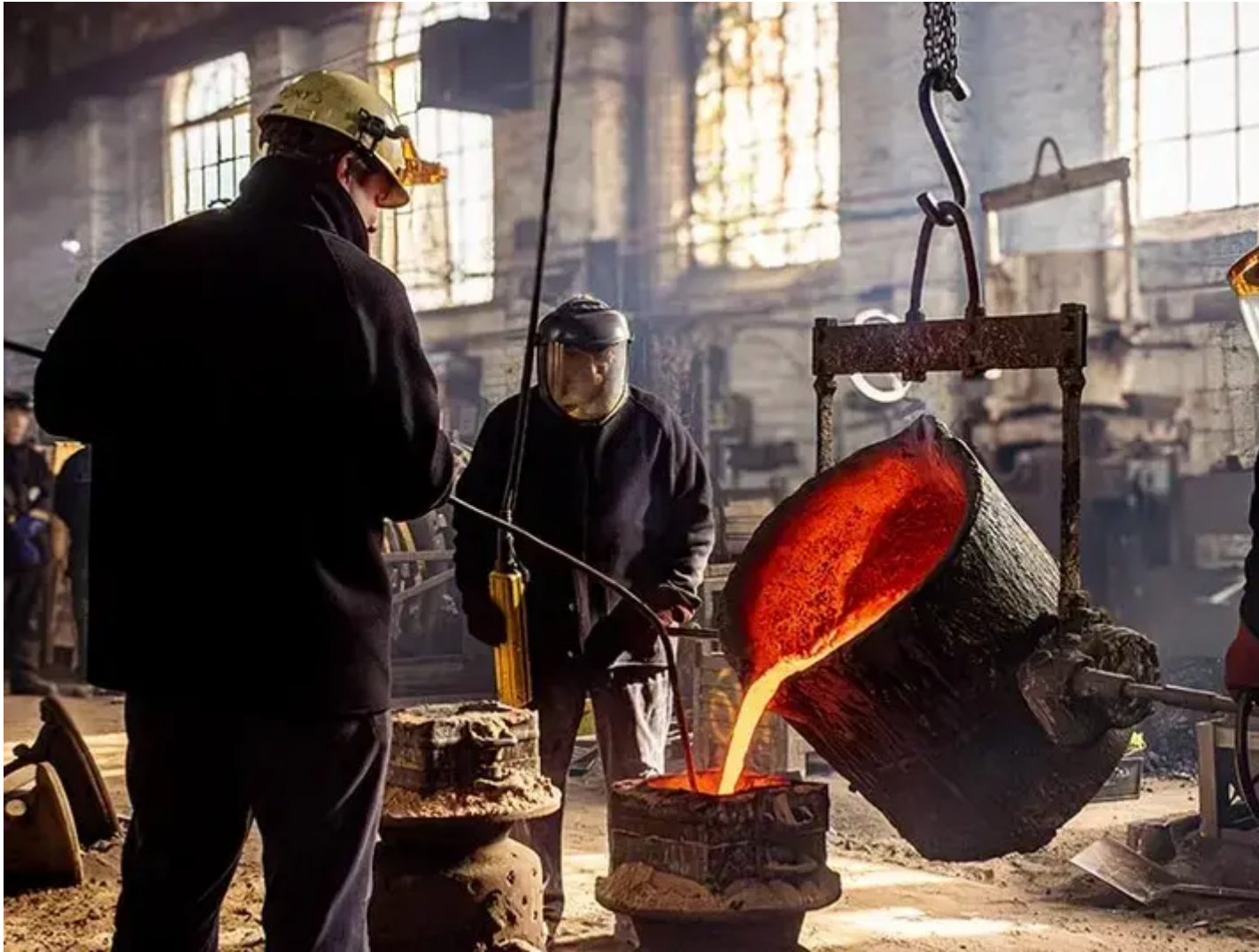
Casting a bell at Taylor's Bellfoundry.

The Delapré Abbey Preservation Trust is securing a sustainable future for the Grade II* listed country house and park by transforming a disused 19th-century stable block into a thriving community hub with spaces for wellbeing, retail and events.