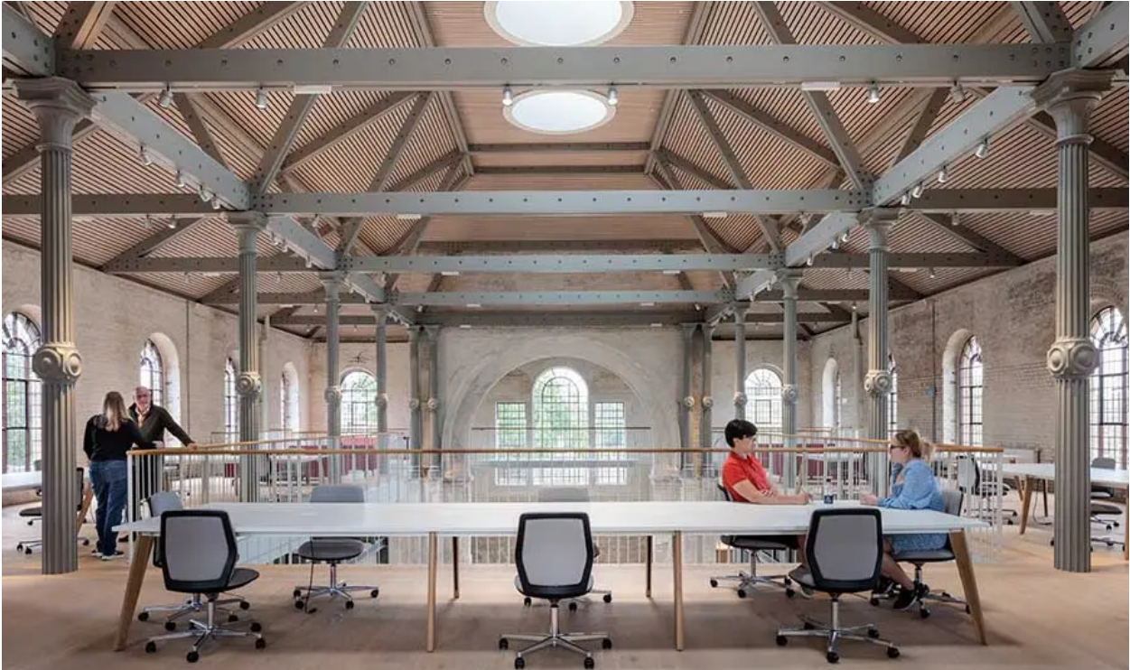
The new co-working space at Sheerness Dockyard Church.

asset at the heart of the community. Its successful revitalisation as a mixed-use public space for events, meetings and co-working has proved that investment in neglected heritage can have major economic as well as cultural and social benefits.”