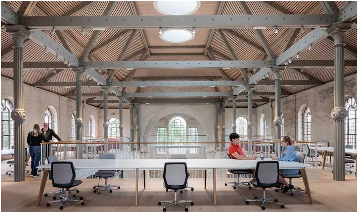
The new co-working space at Sheerness Dockyard Church.

asset at the heart of the community. Its successful revitalisation as a mixed-use public space for events, meetings and co-working has proved that investment in neglected heritage can have major economic as well as cultural and social benefits.”