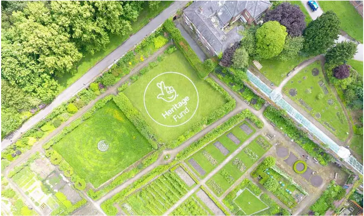
Croxteth Hall and Walled Garden's impressive entry.

Using biodegradable materials, the team at Croxteth Hall and Walled Gardens created an 18m depiction of our acknowledgement stamp on the lawn.