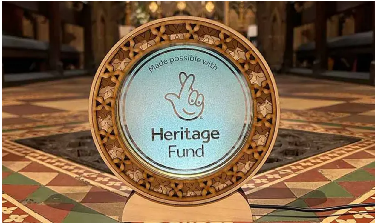
St Mary's Church, Shrewsbury's prizewinning acknowledgement plaque.

The judges were blown away by the creativity shown in St Mary's Church, Shrewsbury's entry to the competition. Designed to match the historic Grade I listed building, the acknowledgement stamp has been laser-etched onto glass and fitted into a birch ply laser-cut frame.