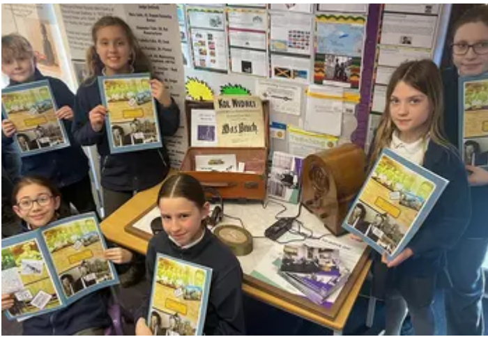
School pupils learned about the Second World War as part of outreach activities at The Hold.