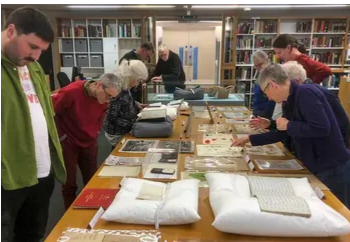
Archives collections at The Hold