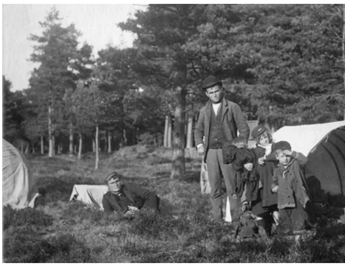
Traveller families camping in the New Forest.