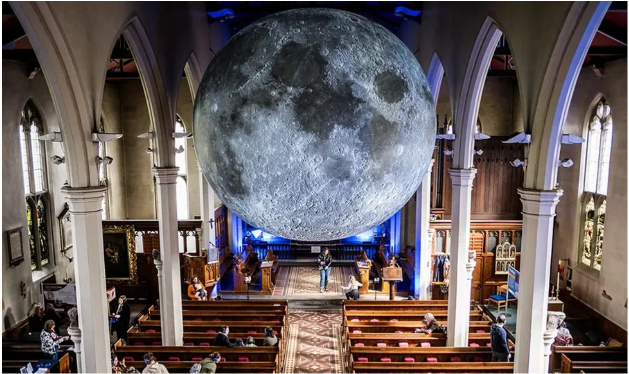
Museum of the Moon by Luke Jerram at St Giles the Abbott church in Cheadle.