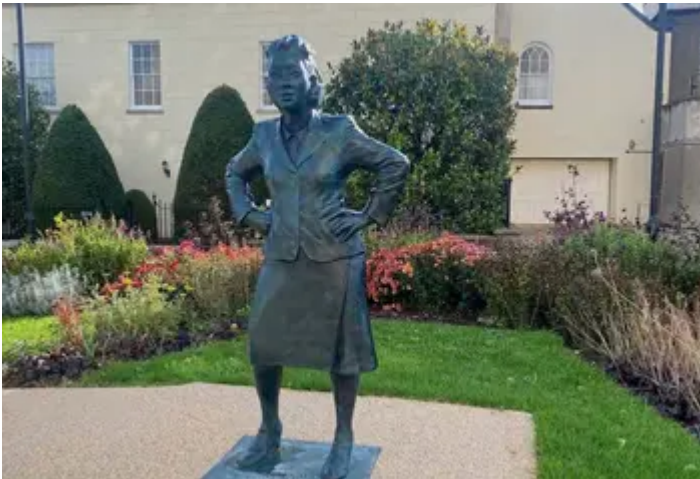
Why Wilding celebrated in new exhibition