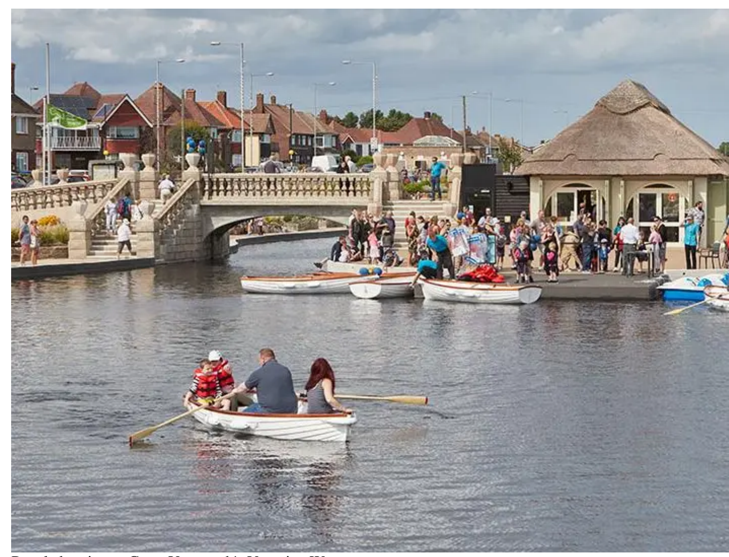
People boating at Great Yarmouth's Venetian Waterways.