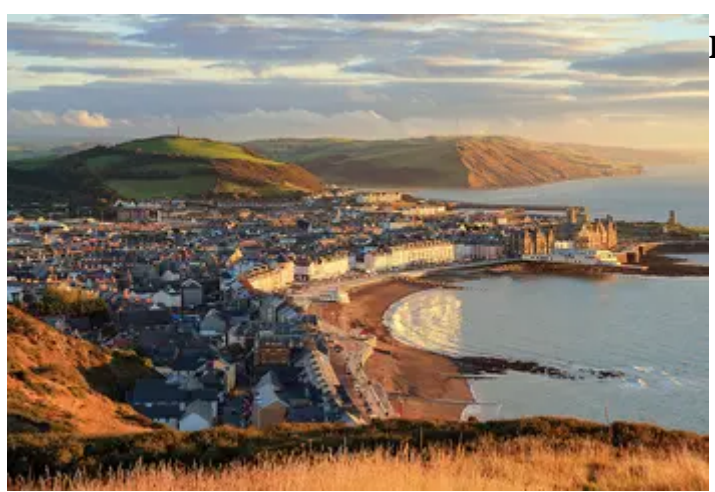
rdeb hefyd mewn ...

Great Yarmouth Borough Council's Tourism Strategy aims to deliver ambitious projects that expand and enrich the town's cultural and heritage offer to further enhance wellbeing and economic prosperity. The ambition is that by 2030, visitors will come all year round to enjoy the area's natural and built environment and diverse culture.