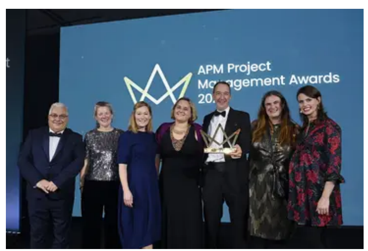
The Future Parks Accelerator team receiving the awards.

The innovative programme used 'accelerator' methods borrowed from tech startups to encourage innovation for green space across the UK.