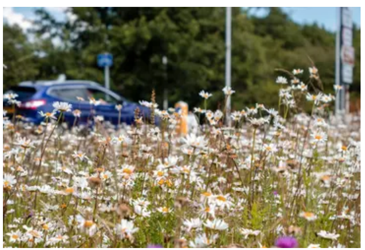
Wild flowers in Kings Tamerton.

and most importantly the people who live in them."