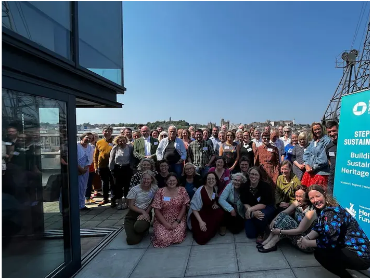
90 organisations took part in Social Enterprise Academy's enterprise development programme.

As the campaign comes to a close, we've collected a summary of learnings and advice from the organisations who took part.