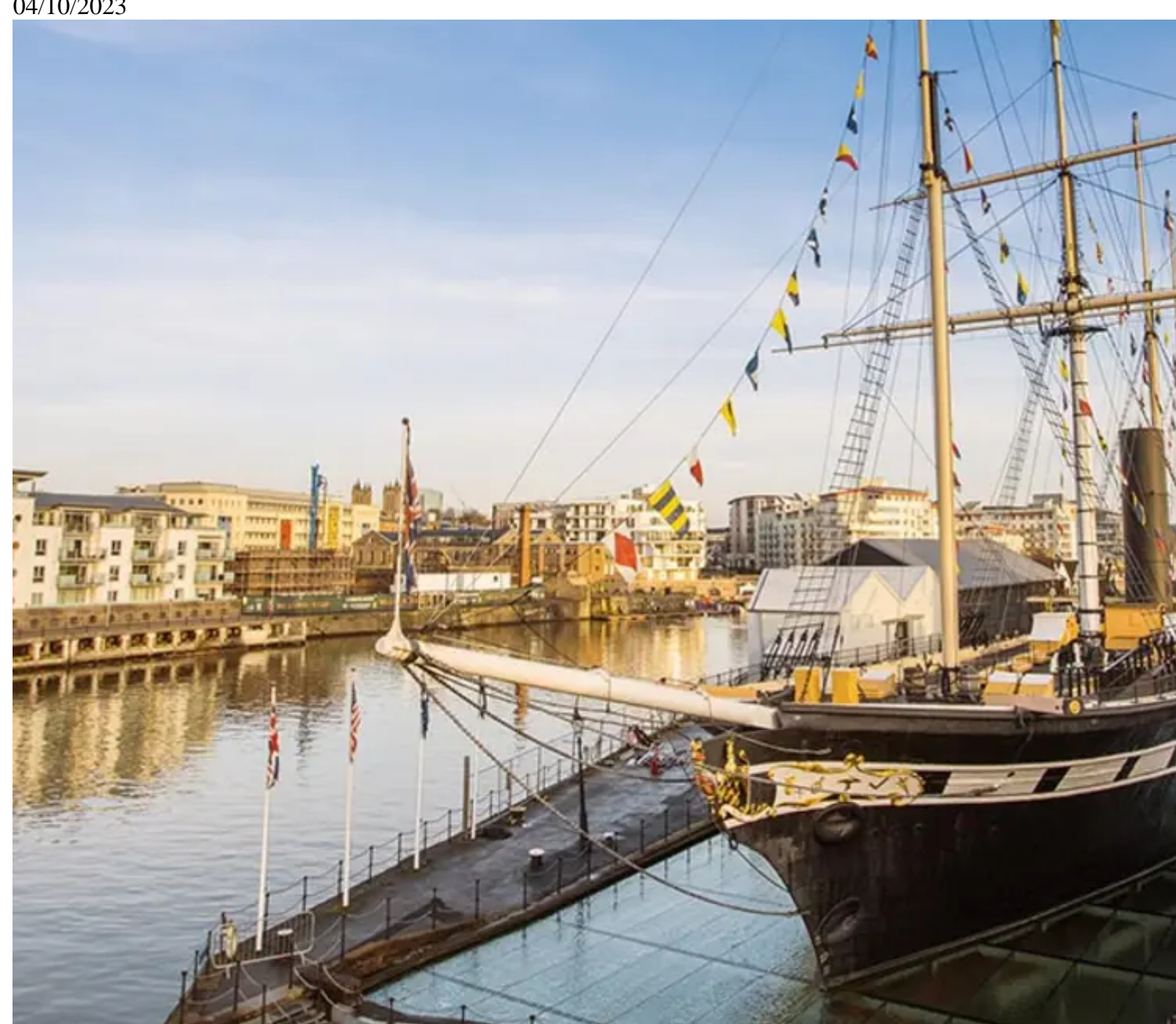
Brunel's SS Great Britain in the dry dock. The SS Great Britain Trust's innovative decarbonising of the conservation system for the world's first iron ship jointly won Sustainable Project of the Year at the Museums + Heritage Awards.