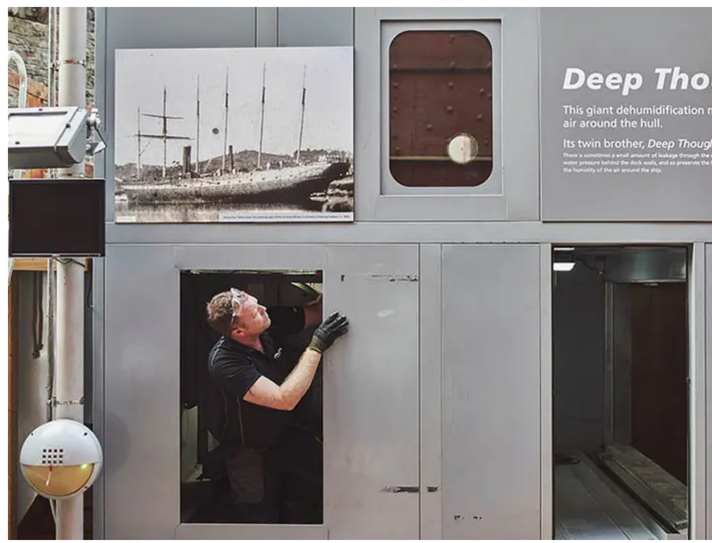
Refitting the dehumidifier fans that preserve SS Great Britain.