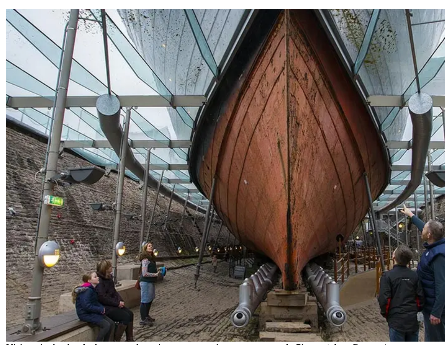
Visitors in the dry dock can see the unique conservation system at work.

Since 2018 the trust has been dedicated to reducing its impact on the environment. As a conservation charity and a large visitor attraction they believe they must both make a difference directly as well as inspire and advocate for change.