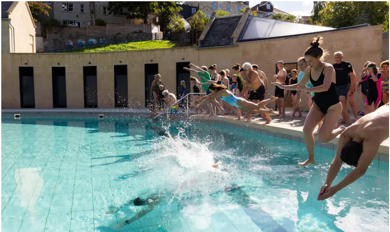
People diving into Cleveland Pools at the celebration event in Autumn 2022.

In Autumn 2022, 100 lucky competition winners were the first to dive into the Pools following a ballot for tickets. For some, it was their first swim but for others, it brought back memories of childhood swimming there over 40 years ago.