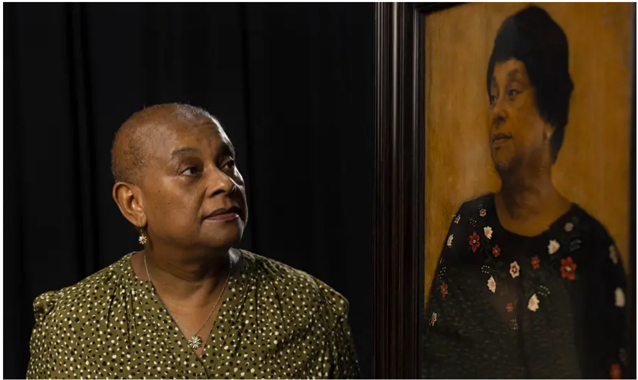
Doreen Lawrence, Baroness Lawrence of Clarendon by Thomas Ganter, 2020

This new portrait was commissioned by the National Portrait Gallery for the reopening. It was announced on the 30th anniversary of Stephen Lawrence's death. Baroness Lawrence has become a key figurehead in campaigning for equality and inclusivity.