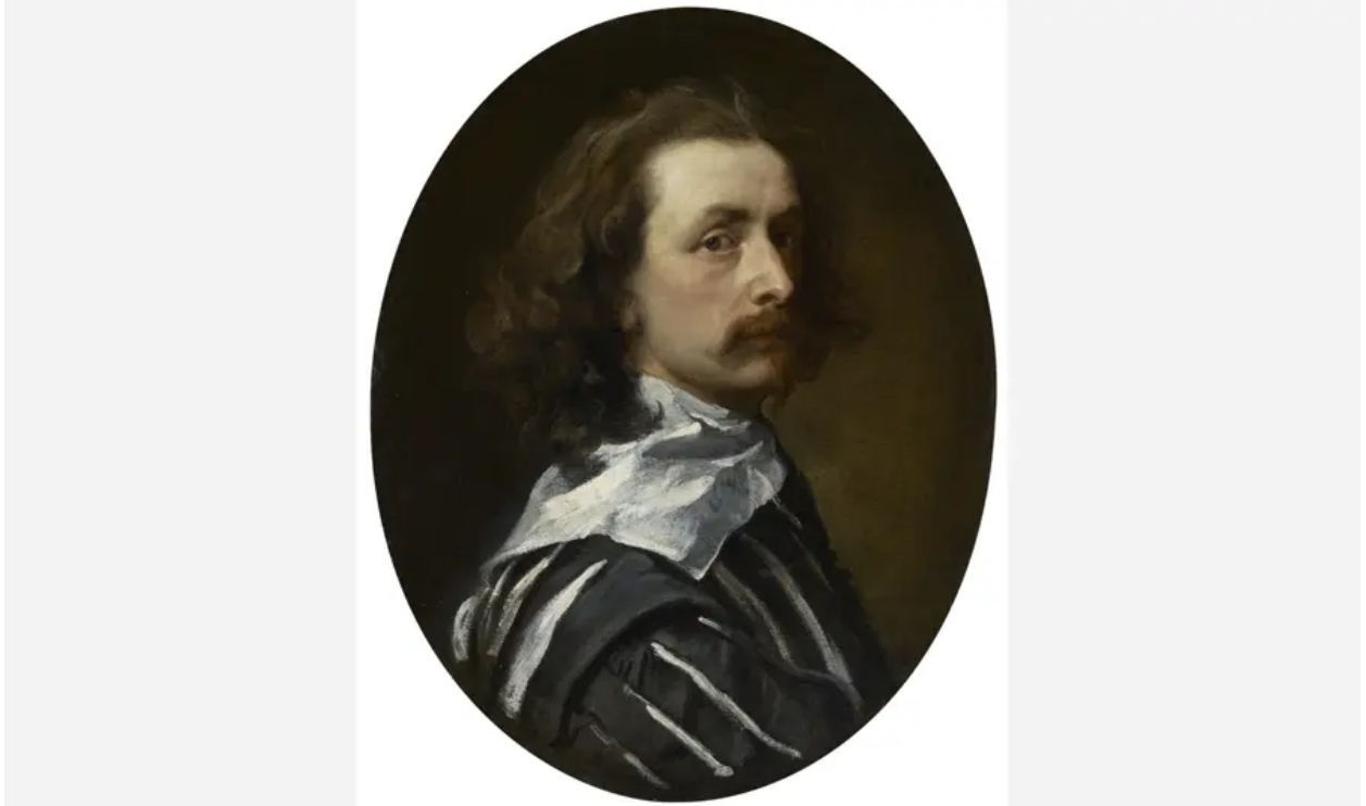
Sir Anthony van Dyck by Sir Anthony van Dyck, circa 1640 © National Portrait Gallery, London.

As one of the most acclaimed royal portraitists of all time, van Dyck was usually found on the other side of the canvas. This self-portrait is said to be one of the finest ever created. It was saved for the nation in 2014 thanks to multiple supporters including a £6.3m grant from the Heritage Fund.