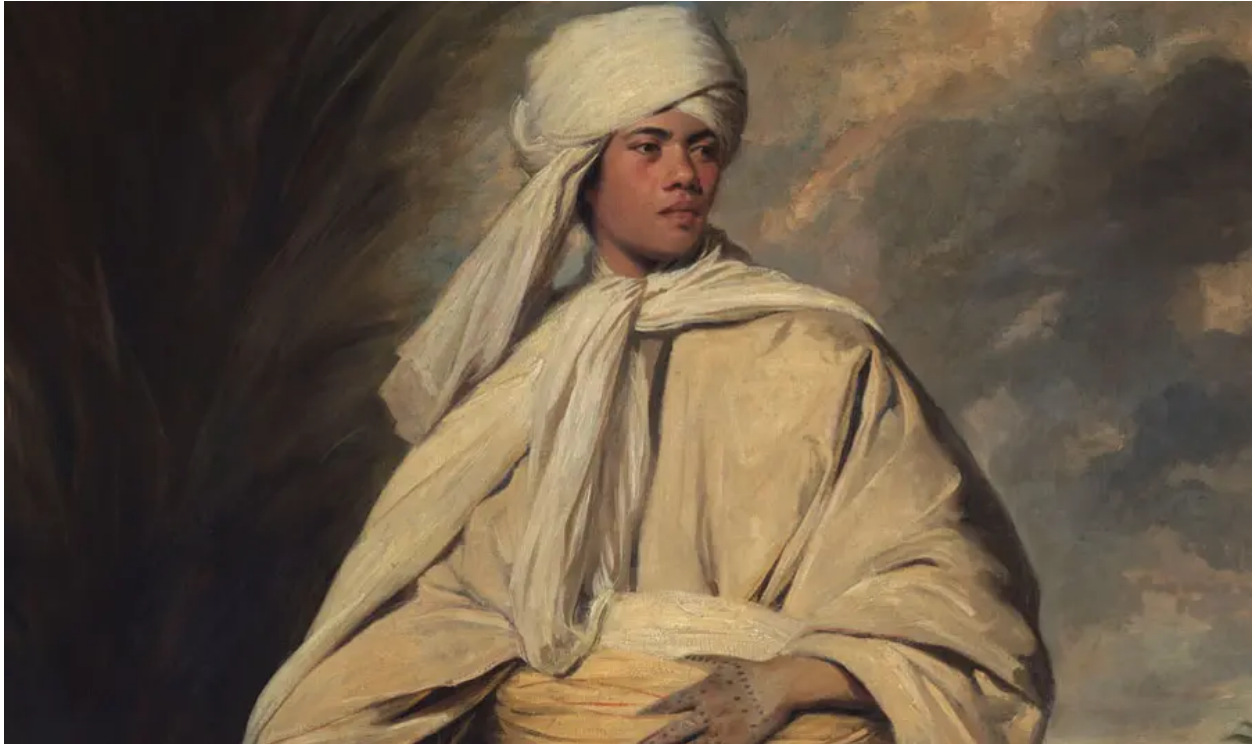
Close up of Portrait of Mai (Omai) by Sir Joshua Reynolds, circa 1776.

Widely regarded as the finest portrait by one of Britain's greatest artists, it depicts the first Polynesian to visit Britain. The painting was saved for the UK following a historic fundraising campaign, including an exceptional £10m grant from the National Heritage Memorial Fund .